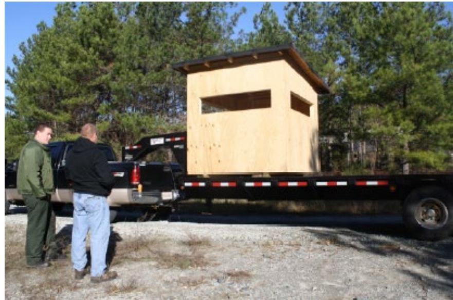
Richard B Russell/Outdoor Dream Foundation Hunting Blinds